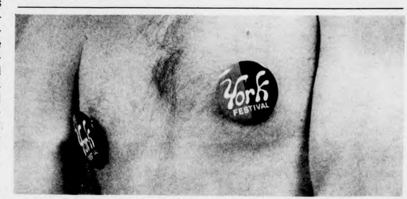
- So you thought festival was only for girls. Even York men - I am not a violent revolution- will bare all for festival, Nov. 8 - 9. (Is something wrong here?)

This week, do something different - attend a meeting, talk to a student rep, or even, think about why you are here.