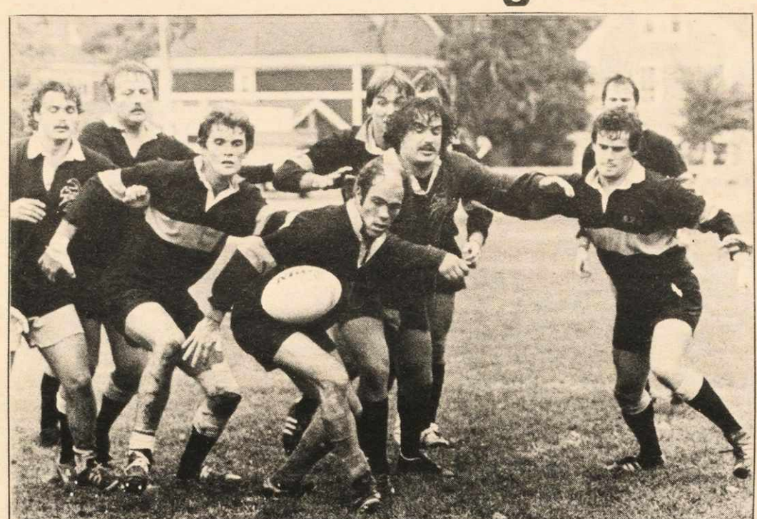
Dal Rugby ran away from the oposition this past weekend.