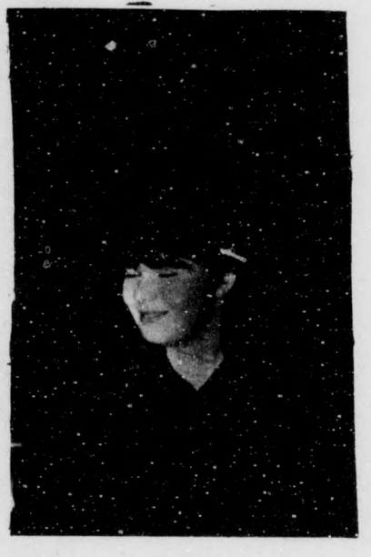
What planned renovatthat the students had ions? What SUB Board? enough involvement in I'm a typical student living a typical student life and I don't get involved in any way with no damn radicals!