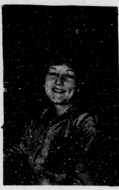
Yes, I think we should have had more input.