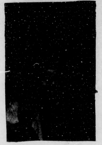
I think so, because all of us are going to make use of it.