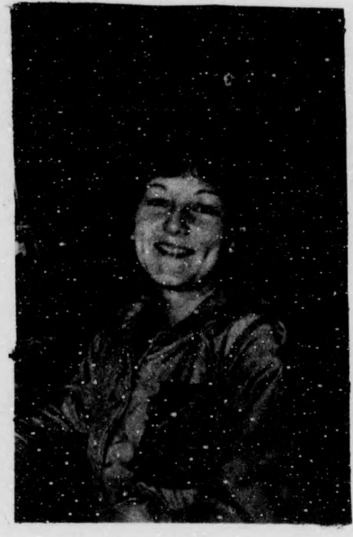
Yes, I don't think the decision.