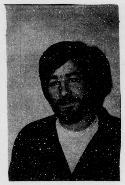
How can any plans made have anything to do with what the students want if the satisfy the present start to finish.