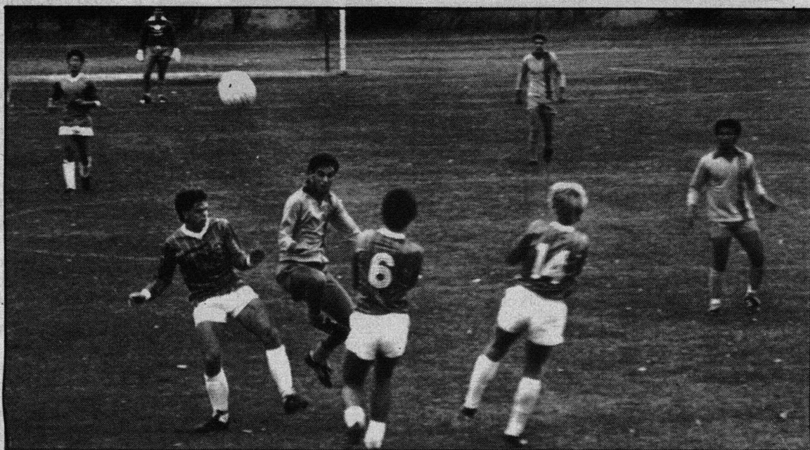
The Bears soccer team (seen here against UBC) won't get a second chance—there are no playoffs.

The return game a week later was a totally different story. With a depleted line-up due to injury and other club commitments the Bears were trounced by U.B.C. 4-1, and