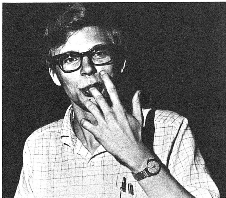
SORRY DAVID ... but we just couldn't resist it either (see student handbook)