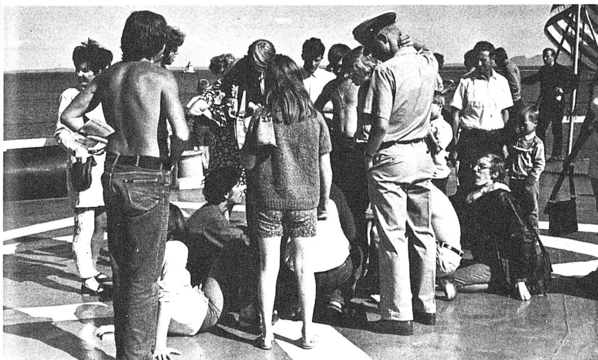
"ACTION" AGAINST U.S. COAST GUARD ... results in stickers plastered on gunwales