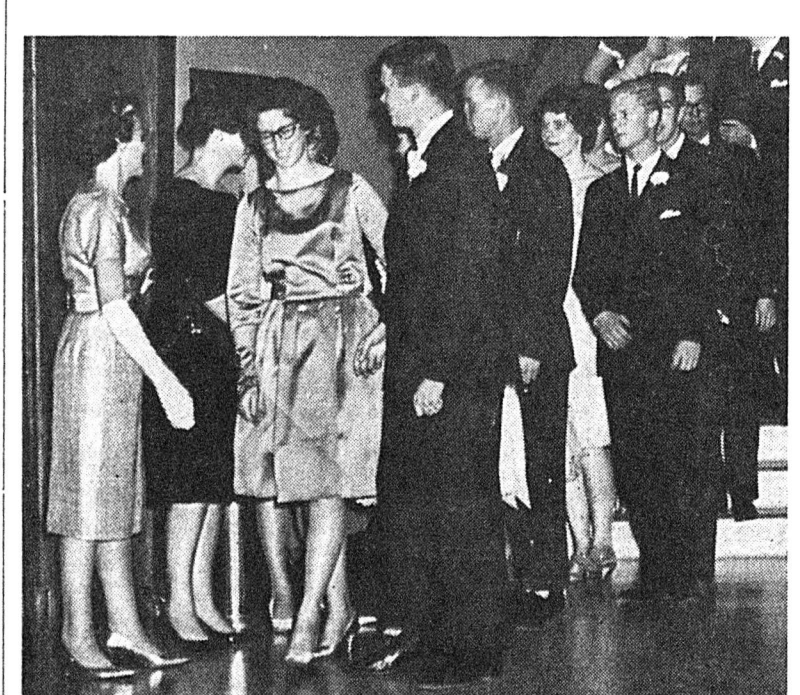
WHOOPING WAUNEITA Society squaws and their bucks descended en masse in full tribal regalia at the Jubilee Auditorium Saturday night. The occasion was U of A's annual Wauneita Formal—inspired by Sadie Hawkins' Day in Dogpatch.

USNSA has also called for an end to "in loco parentis" where the university must act as a parent to the