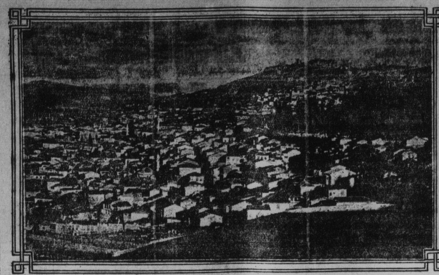
London, May 27.—A revolutionary movement against Turkey at Aiden in other towns. Two thousand Turkish troops in that region have deserted and men are deserting from the coast guards.