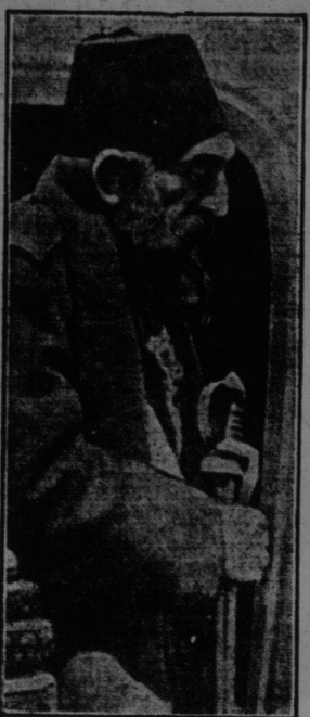
ABDUL HAMID, deposed Sultan of Turkey, whose private correspondence will soon be officially published by the new Government in Constantinople. It is said the letters give the first clear insight into his barbarous cruelties and iniquities.

Boston, April 4.—Governor Eugene F. Foss withdrew his name tonight from the presidential preference primary ballot. In a letter accompanying the withdrawal, he asked the delegate candidates to pledge to him to consider themselves unpledged.