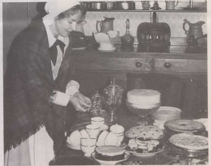
Inside Dundurn Castle, Hamilton, Ontario where Christmas activities include tours and treats from the kitchen, the butler's pantry table is set.