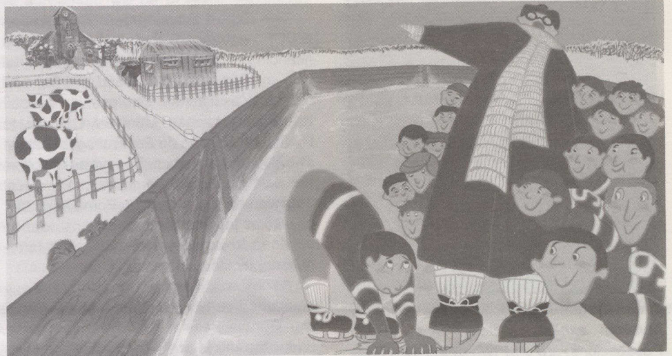
Illustration from The Hockey Sweater , 1984. The acrylic on masonite paintings for the book by Sheldon Cohen are on display at the McCord Museum in Montreal.

The search for an explanation of the star of Bethlehem, recorded in St. Matthew's