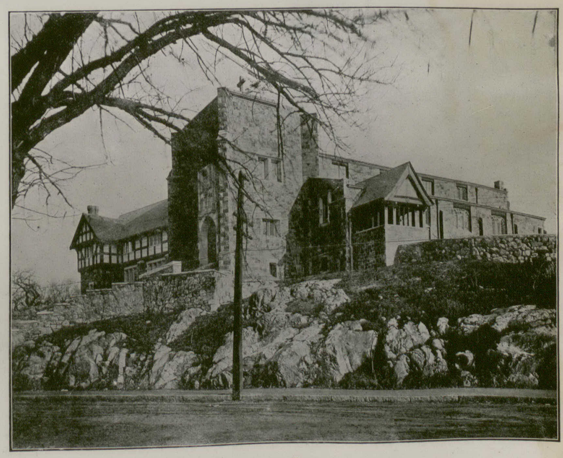
CHURCH AT COHASSET, By Messrs. Cram, Goodhue & Ferguson, Boston, Mass. From a photograph in the Eighteen Club Exhibition, Toronto.