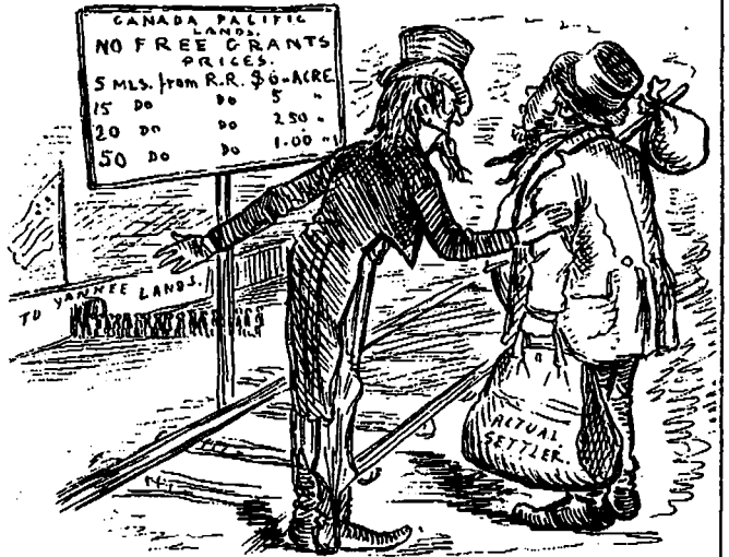
OUR LAND POLICY. UNCLE SAM.—If you want a good farm come right along with me. You see you ain't wanted in this country.