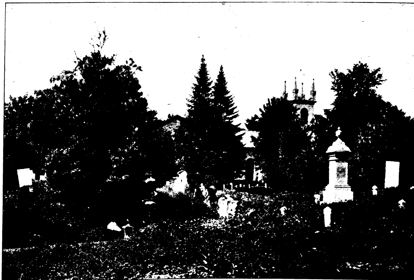
ST. MARK'S EPISCOPAL CHURCH AND CEMETERY, NIAGARA, ONT.