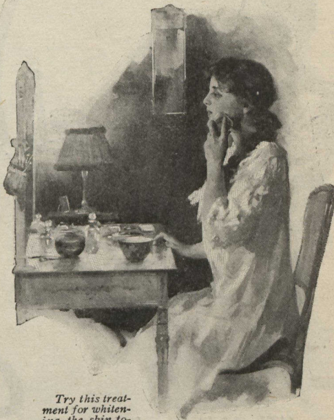
Try this treatment for whitening the skin to-night.

4th—For sallow, freckled skins. Dip the cake of Woodbury's in a bowl of water and go over your face and throat several times with the cake itself , letting its lather remain on over night.