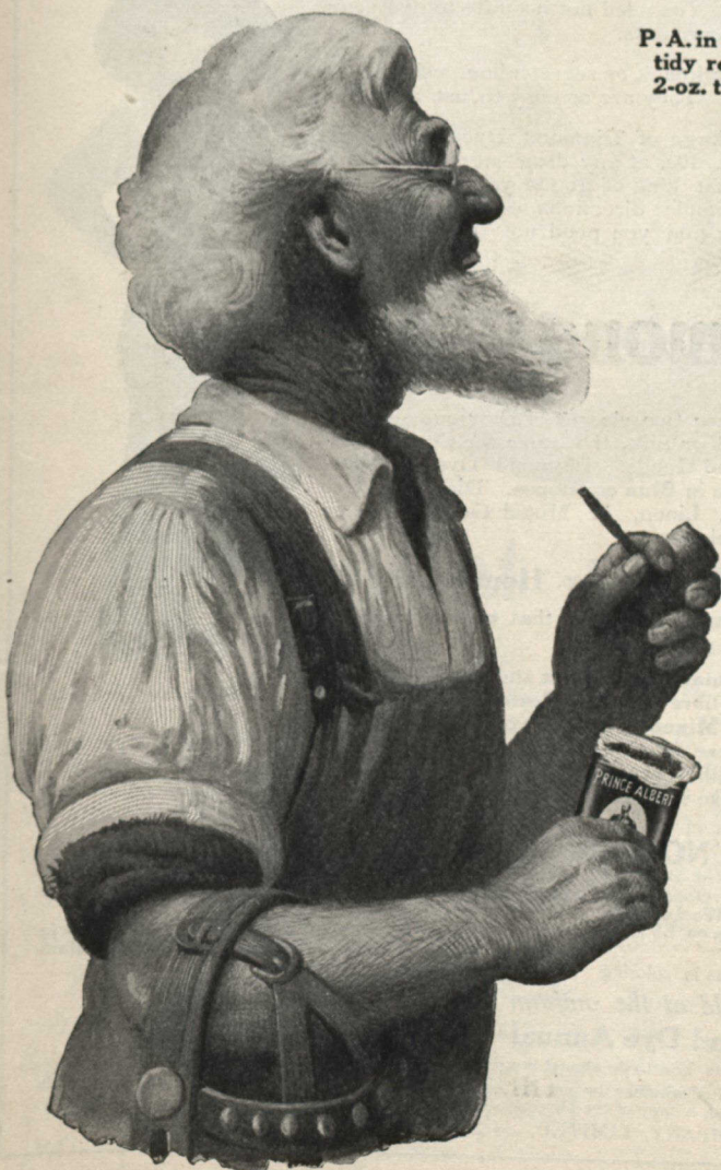
P. A. in the tidy red 2-oz. tin

Get this, men, as it's handed out, fair and square: P. A. is the one tobacco that's got everything any man who knows the delight of a pipe ever dreamed of. It can't bite , because the bite's removed by a patented process. That's why millions of men fondly call P. A. the "joy smoke." No other tobacco can be like Prince Albert!