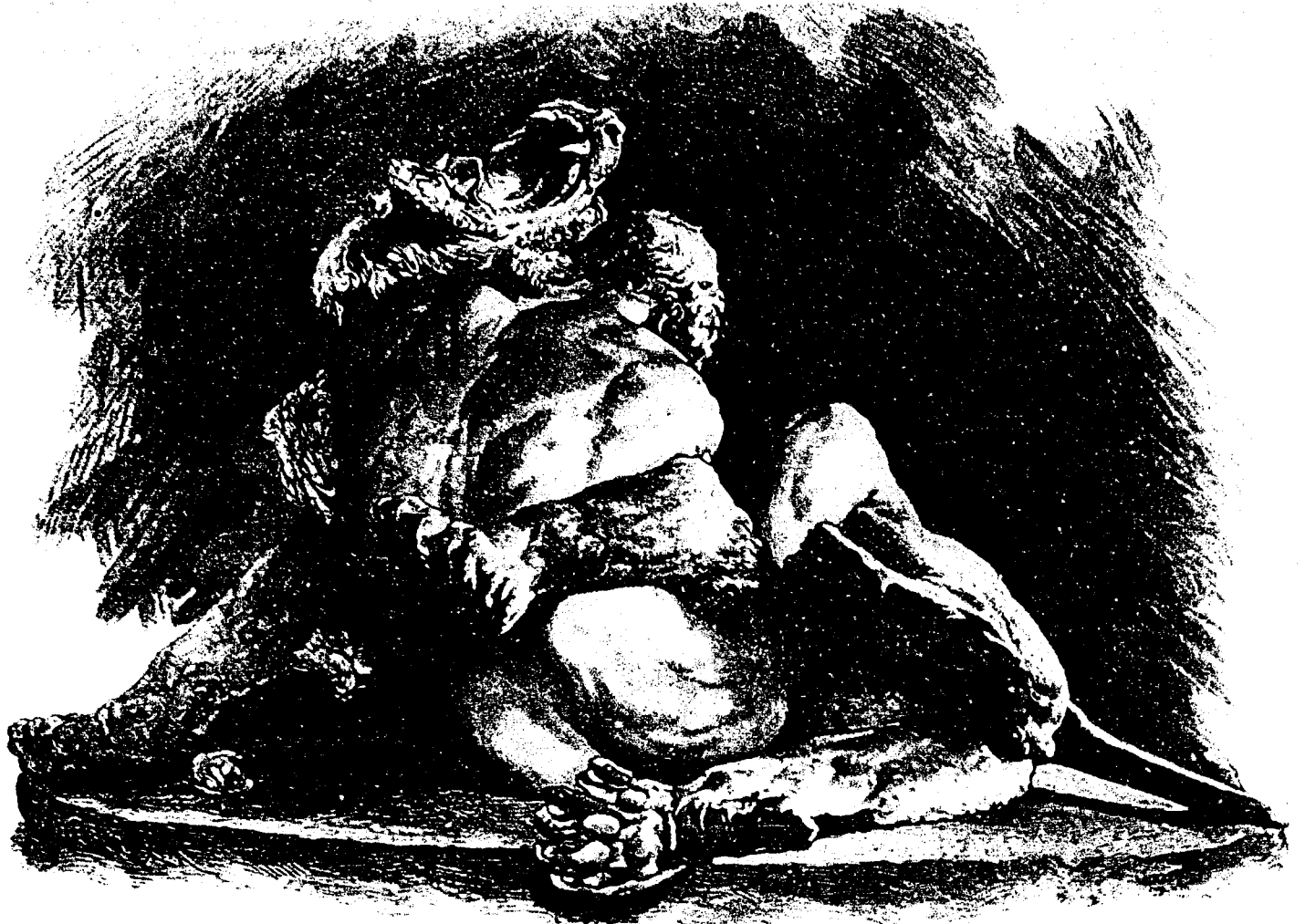
IN THE ROMAN CIRCUS — BRONZE GROUP BY MAX KLEIN.