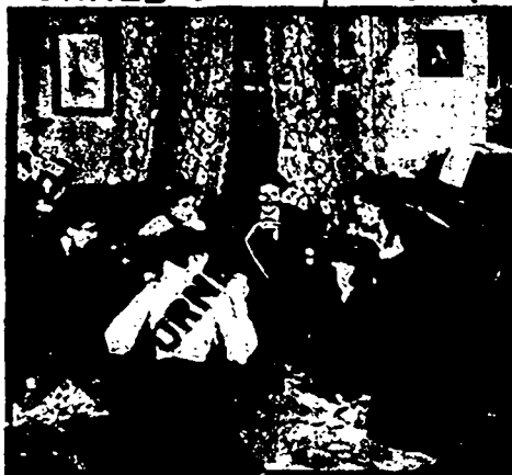
Nerlich & Co.—The Game of Blow Ball.

whole company of people for the evening. The balls are of light basswood, easily blown about, and go through tin goals placed on the table. The cloth is taken off the table and the smooth surface is just the thing for the game.