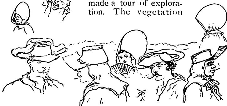
MARKET DAY—TYPES OF NATIVES.

is kept by a motherly-looking Scotch woman and her son and daughter, all of whom did their best to make us feel at home. Close by is the charming Borges Garden, where I reposed upon the grass while the rest of the party made a tour of exploration. The vegetation