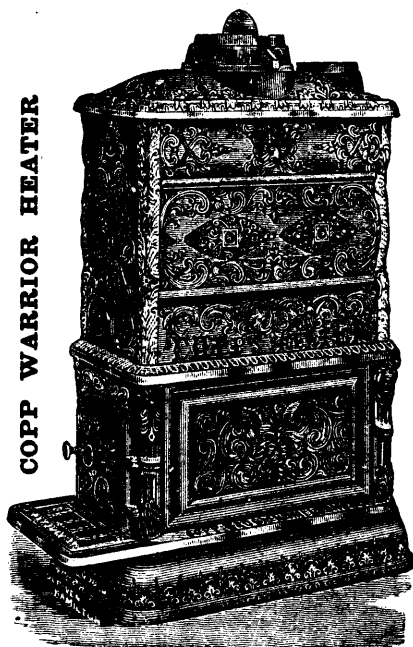
COPP WARRIOR HEATER

A short explanation of this magnificent and powerful heater may be useful to many who do not wish to go to the expense of a Furnace, and yet obtain a like result.