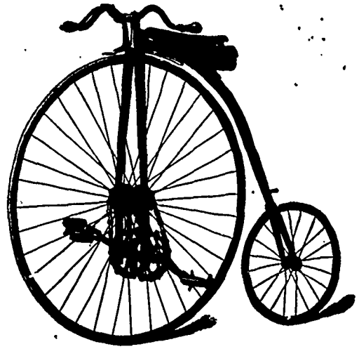
THE RUDGE SAFETY.

Practical experience is worth volumes of talk.