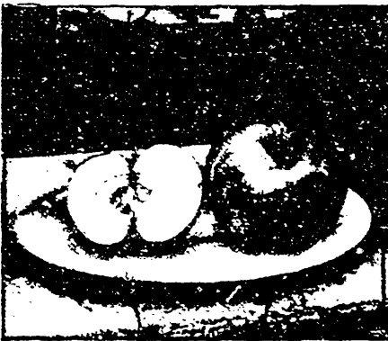
FIG. 2360. RED ASTRACHAN APPLE.

During the last four years New York State and Ontario have been producing this apple in such quantity that after the first two or three pickings the price has been very low and we have been compelled to seek for a distant market. The apple is so tender that it is impossible to land it in the British markets in good condition except by cold storage, held at a temperature of about 33 F., a condition which it has hitherto