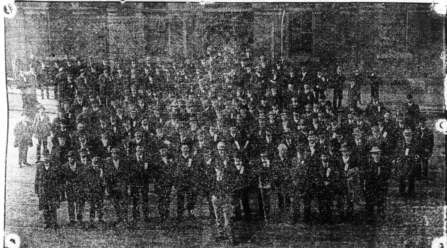
MEMBERS OF B. C. MINING CONVENTION, 1903.