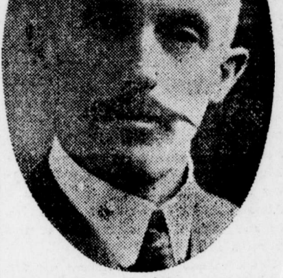
HIS WORSHIP MAYOR STEVENSON.

MAYOR AGAIN AS RESULT OF RECOUNT FINISHED SATURDAY