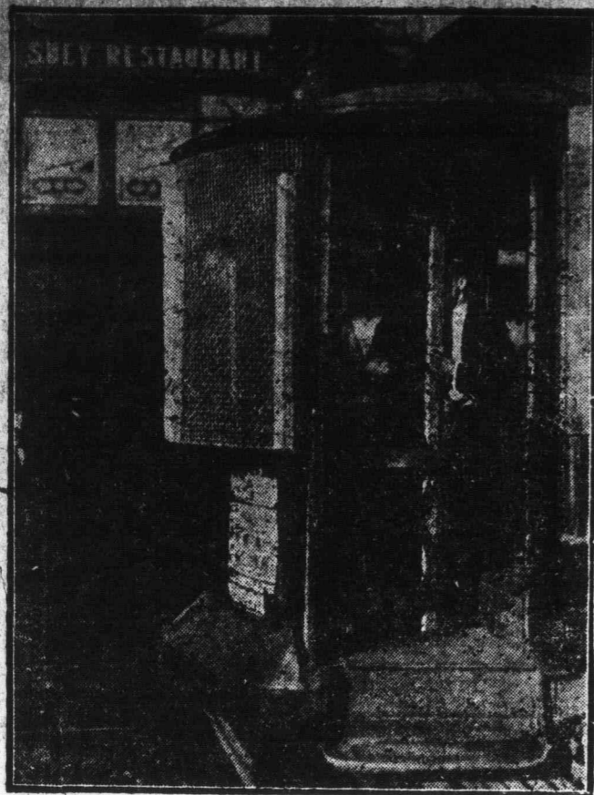
ARMORED STREET CARS IN BROOKLYN.

A view of one of the armored cars run in Brooklyn during the recent street car strike.