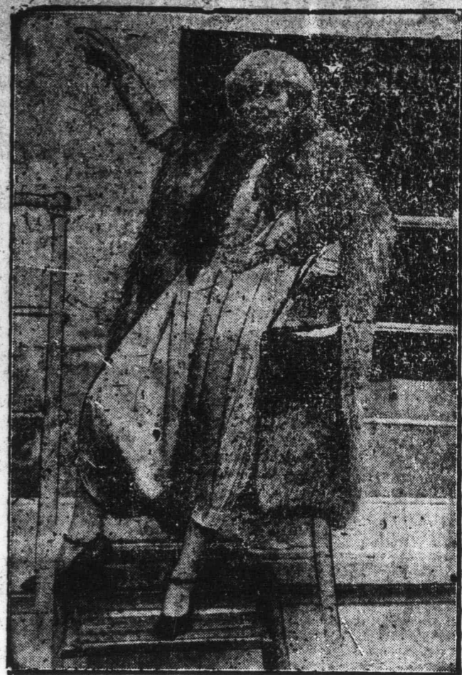
THE VERY LATEST IN FASHIONS TO REACH NEW YORK.

Tests of a luminous cable by which steamers may enter and leave port during heavy fogs have been attended