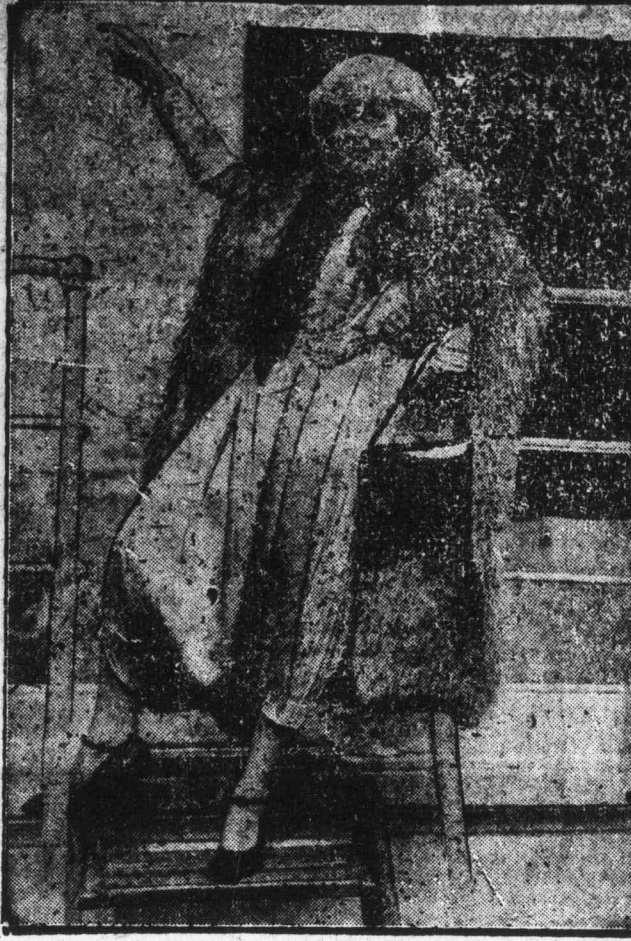
THE VERY LATEST IN FASH IONS TO REACH NEW YORK.

Tests of a luminous cable by which steamers may enter and leave port during heavy fogs have been attended