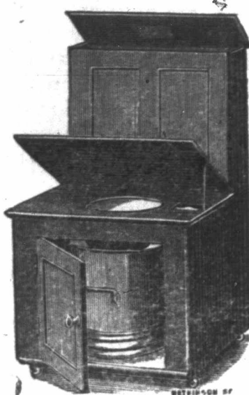
Pull-up Handle Commode.