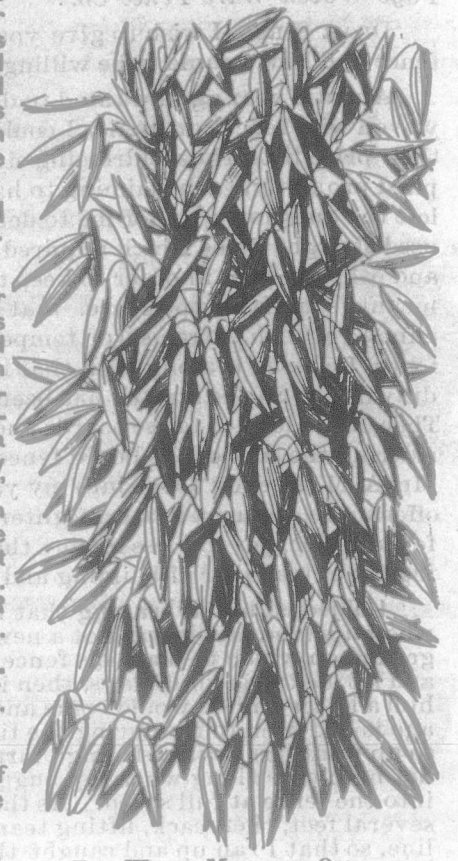
THE WHITE MONARCH OAT.