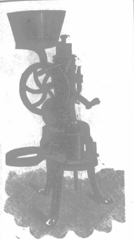
4 Sizes. National style B. National style No. 1. National style No. 1A. National style No. 5.

Is the one who is the happy possessor of