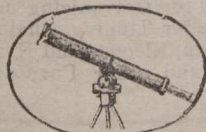
Registered Trade Mark.

Locks in all qualities for Cabinet Makers, Sash Fasteners, Locks & Brassfoundry for Builders' Ironmonger. ALL KINDS OF KEYS MADE on the PREMISES.