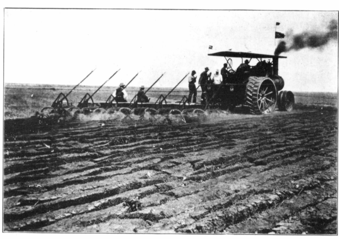
As It was pulled at the Winnipeg Motor Contest by a Rumely 35 Horse Pawar Sceam Engine. (Bronze medal winner class C steam engines.)