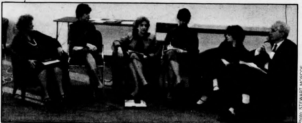
This panel of experts chaired the "Careers for Women in Science" seminar

She also discussed what she called the "dual ladder concept," saying that she believed the technical ladder was a "shorter route to success. If a promotion to management becomes available, and if doing science turns you on, maybe you should decide to stay a working scientist."