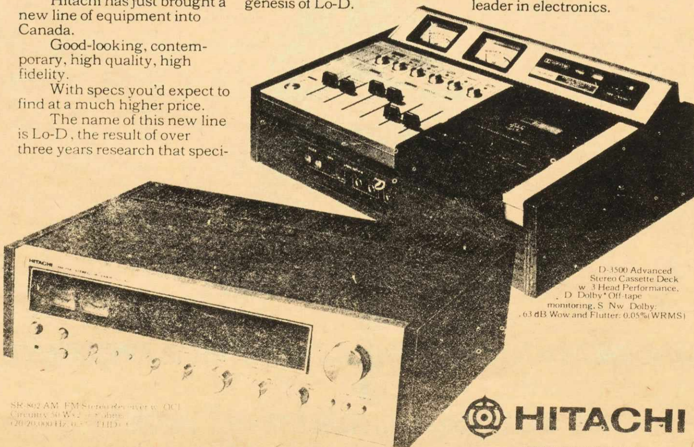
D-3500 Advanced Stereo Cassette Deck w/ 3 Head Performance, D Dolby* Off-tape monitoring, S Nw Dolby: .63 dB Wow and Flutter: 0.05% (WRMS)

The kind of achievement that has made Hitachi a world leader in electronics.