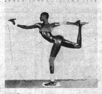
Grace Jones Island Life $7.50