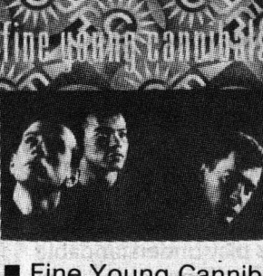
■ Fine Young Cannibals Debut LP $7.50