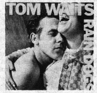
■ Tom Waits Rain Dogs $6.95