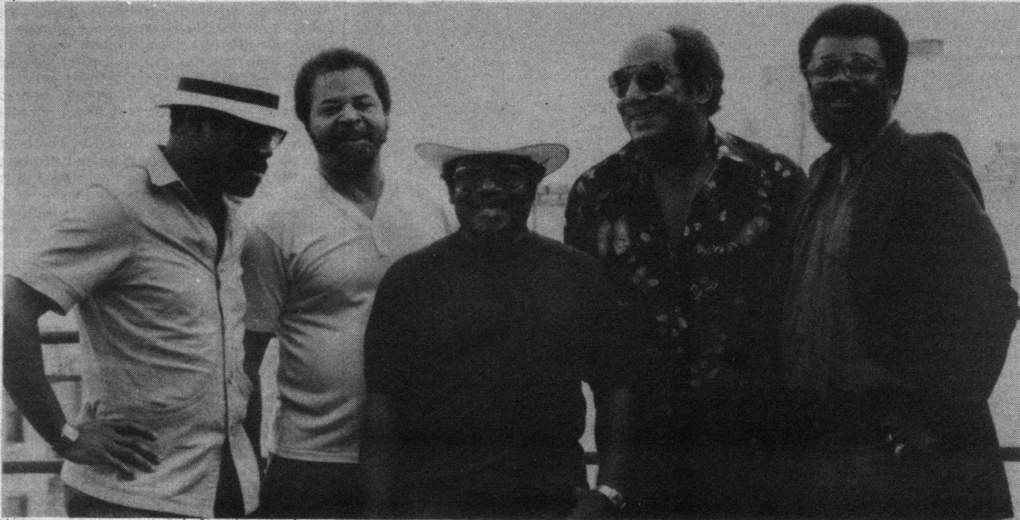
These charming gents are the Nat Adderley quintet. They are going to be appearing at Centennial Library Theatre March 12. More next issue.