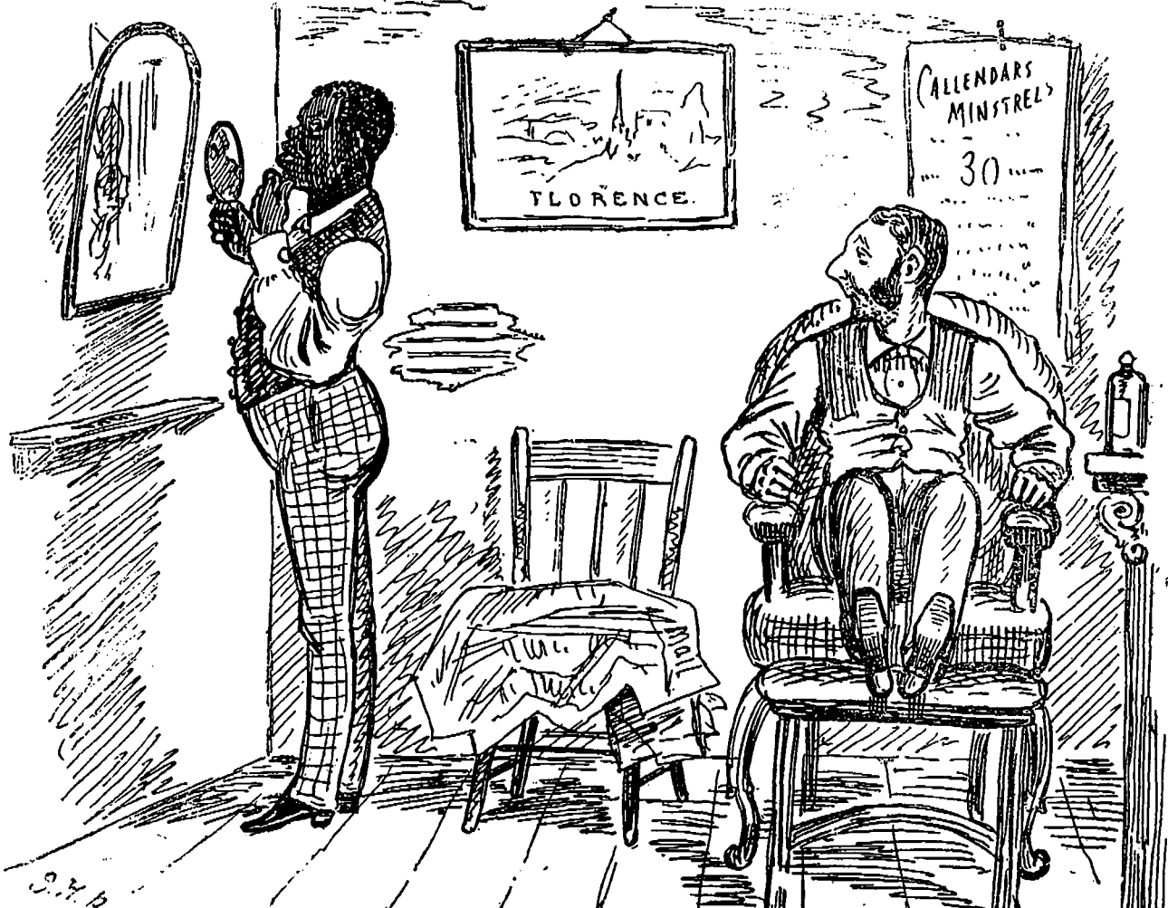
NATURAL EFFECT OF "CULTURE."

THE HAIRDRESSER (a reader of the "MAIL")—DON'T BE IN A HURRY, BOSS; JES' WAIT FOR VER BETTERS. PER'APS YOU'RE NOT AWAR' DAT DE "PREDECESSORS OF DE HAR'DRESSERS WERE DE BARBER-SURGEONS OB DE NORMAN KINGS AN' DE COMPANIONS OB SCHOLARS IN DE FLORENTINE RENAISSANCE!"