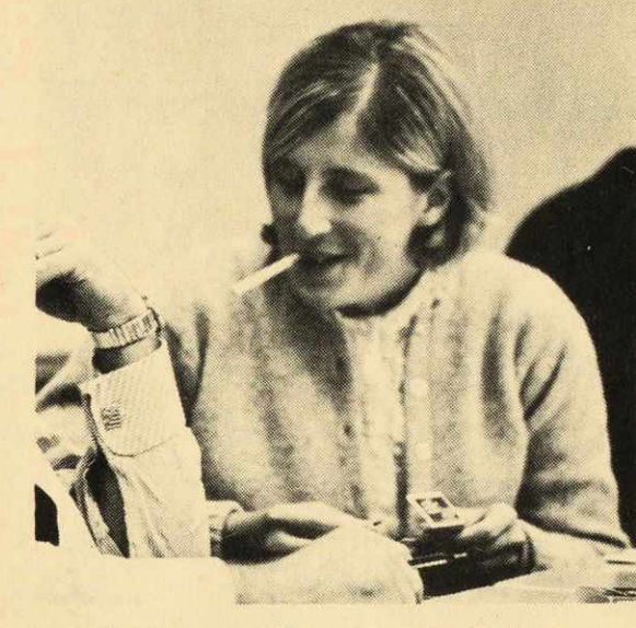
Marijauna and Power are simply divine.