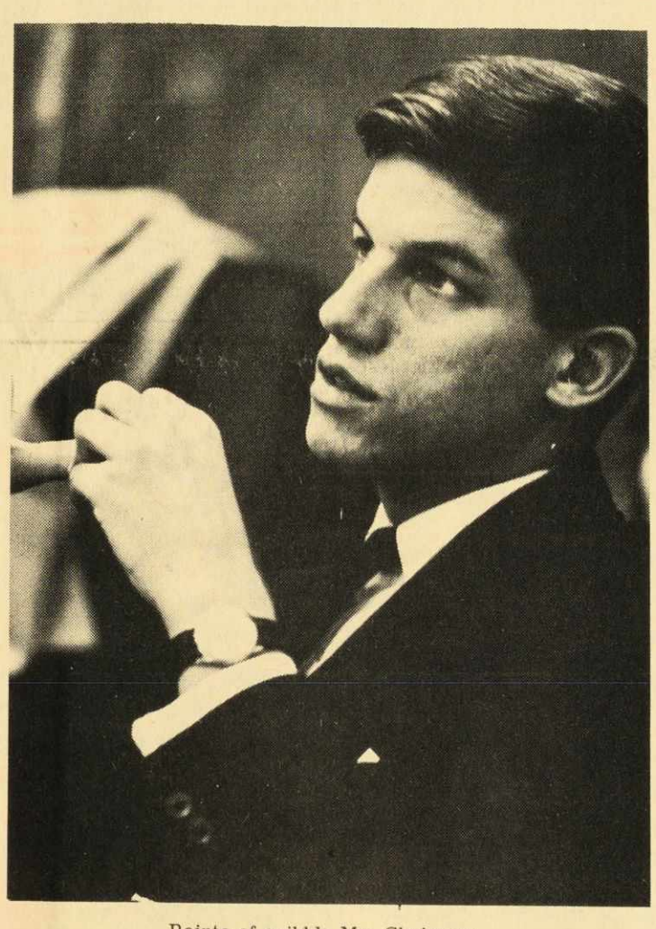
Points of quibble Mr. Chairman.

The Dalhousie Gazette respectfully dedicates this box to our Union leaders. We believe it shows all of us the superb quality of their alert performance to date.