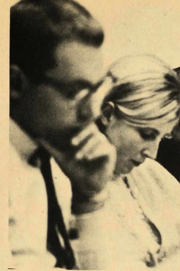
If only they would take Executive decisions on