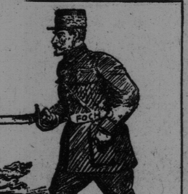
New York Herald.

If you are not strong or well you owe Store and all other druggists.