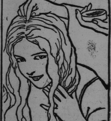
Cuticura Helps Clear Away Dandruff and Irritation

"The peasants' hunger for land ownership has been disappointed under the rule of the Bolshevik party, which is uncompromisingly Communist and does not admit any individual right of property. The land is now held by those who have the power to seize and keep it. An equitable distribution was to have been made by the National Assembly, and perhaps the clearest political purpose now in the mind of the peasant is to revive