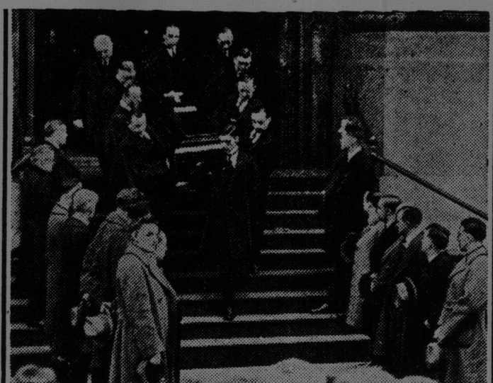
William "Wild Bill" Donovan, former big league baseball manager, who was killed in the recent wreck of the Twentieth Century Limited near Erie, Pa., was carried to his last resting place in Philadelphia, where his family lives.