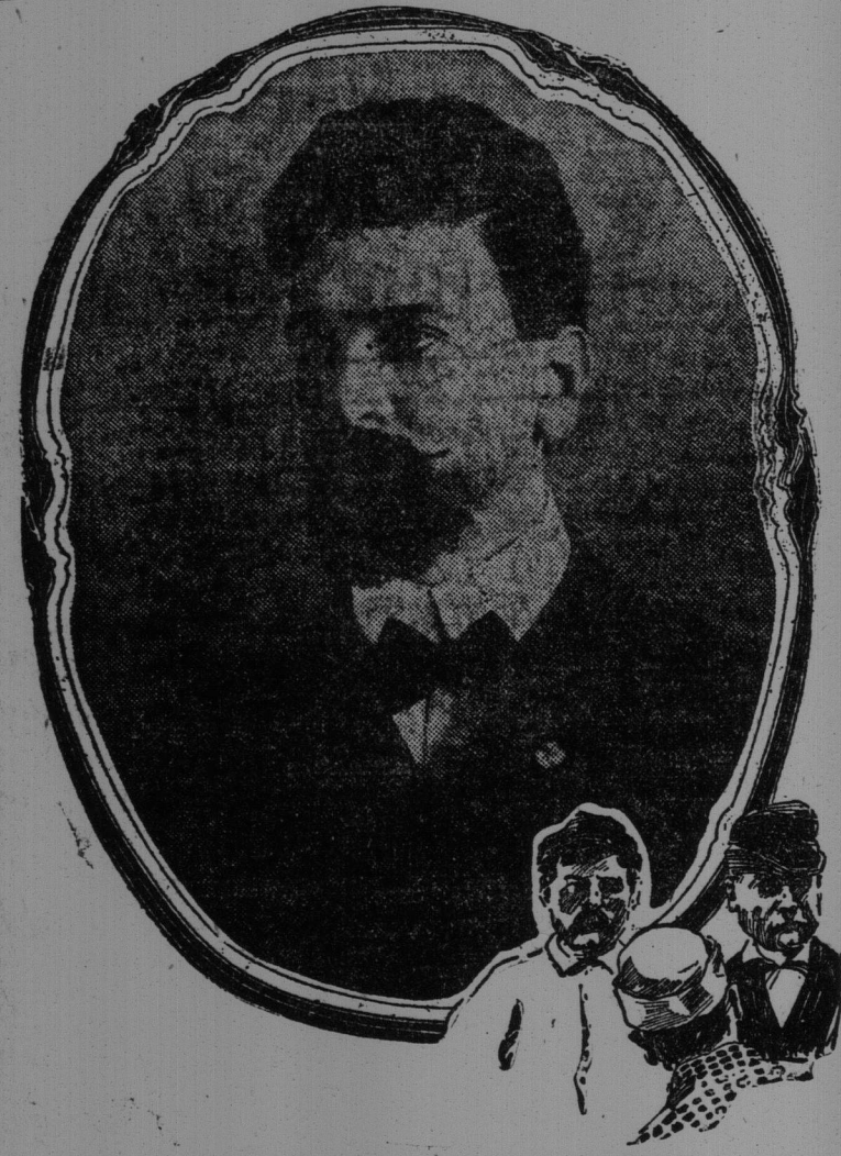
MAYOR SCHMITZ OF SAN FRANCISCO