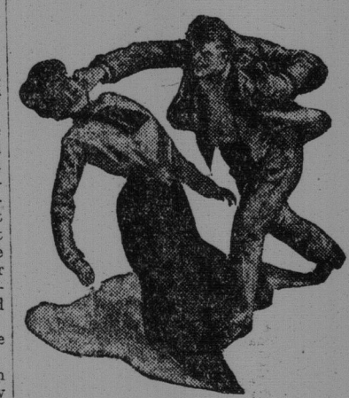
One Mad From Whiskey.

Let no woman despair. The sure, quick, permanent cure for drunkards has been found.