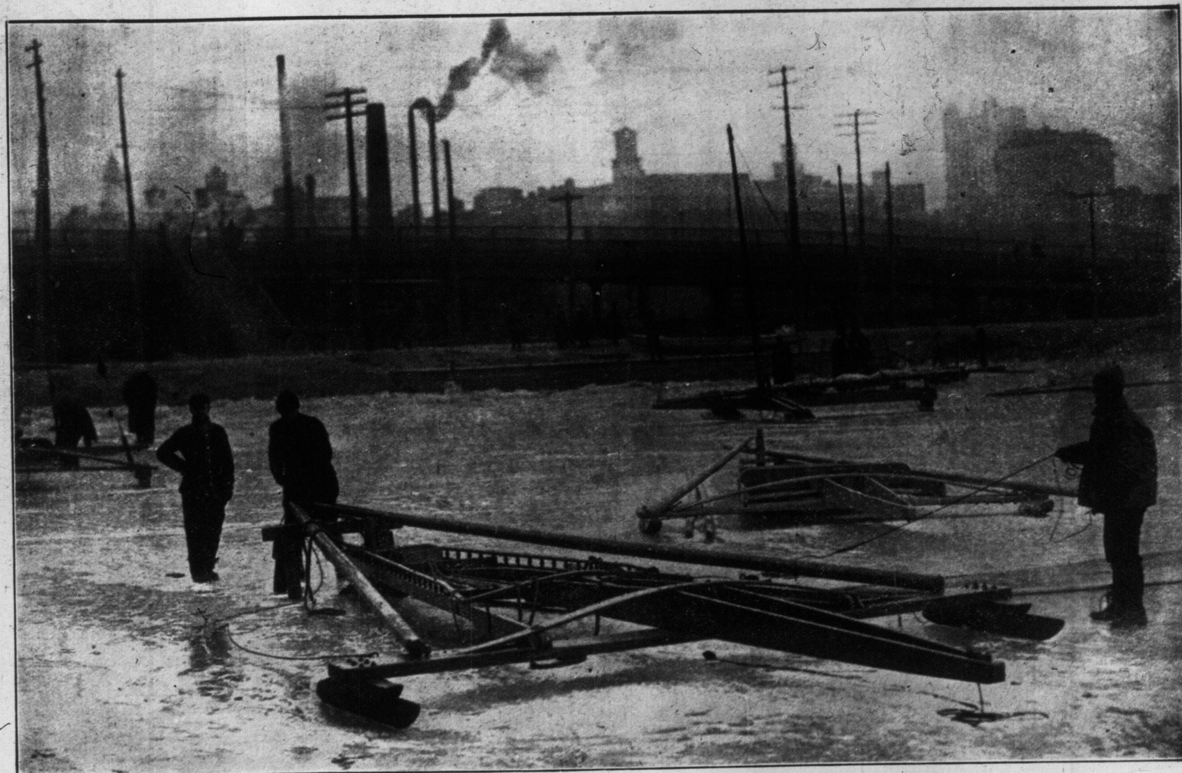
GETTING READY FOR THE FIRST SOLID ICE OF THE YEAR ON THE BAY ON SATURDAY, THE 8TH.