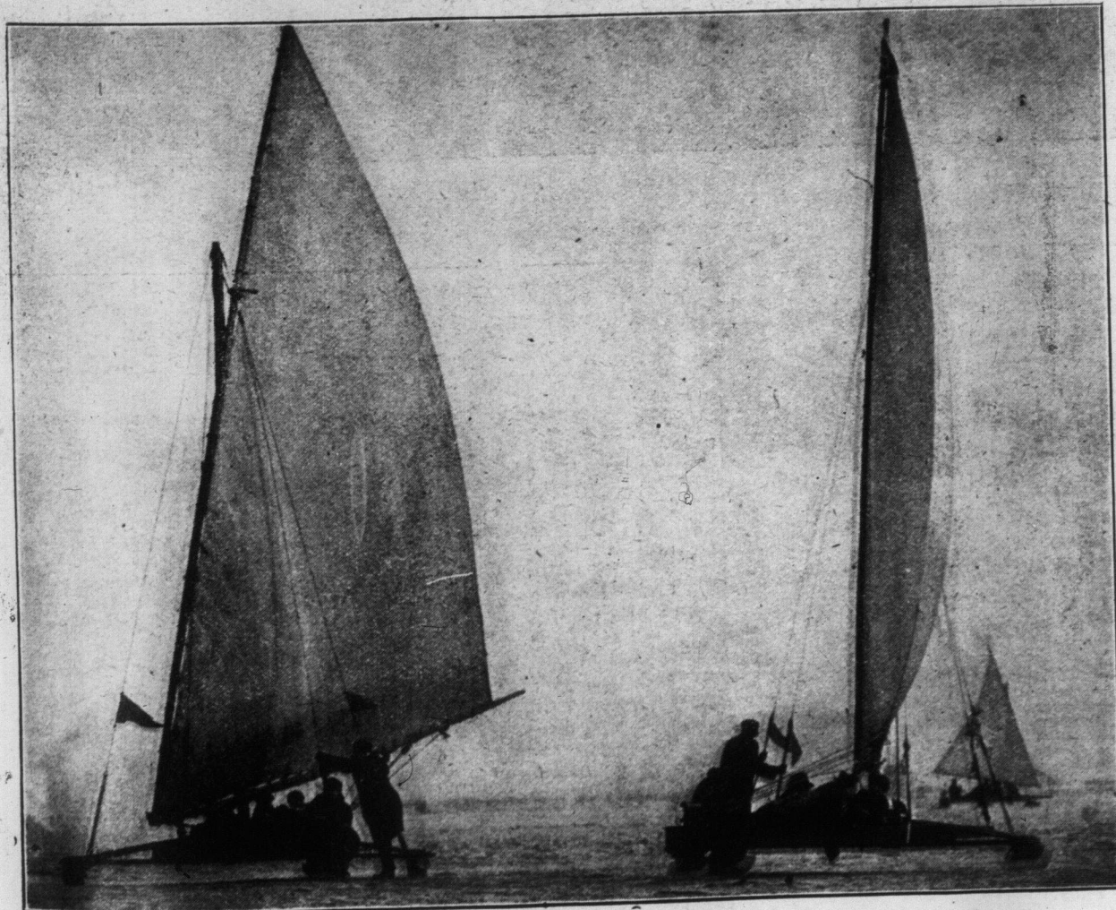
THE "ROYAL ALEXANDRA" AND THE "ZORAYA" JOCKEYING FOR WIND.