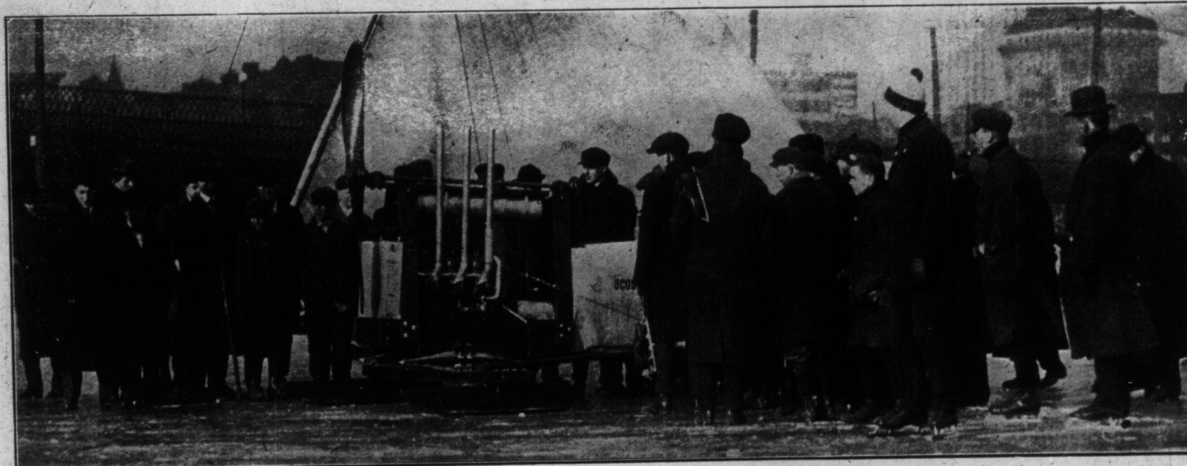
LOOKING OVER "SCOUT JR." THE LATEST THING IN ICEBOATS.