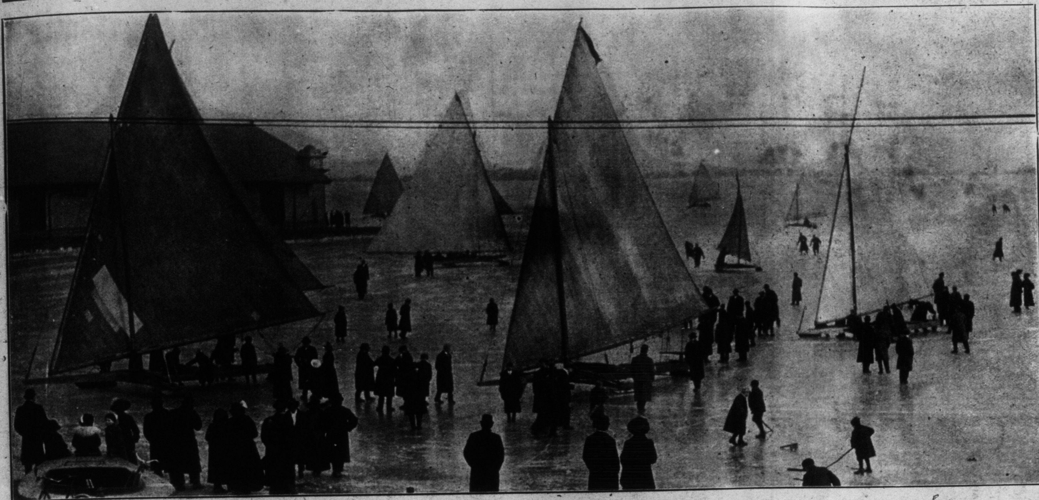
A FEW OF THE FLEET OF ICEBOATS IN THE SLIP AT THE FOOT OF YORK STREET ON SUNDAY.