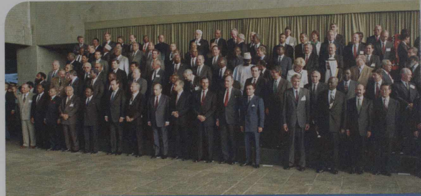
At the 1992 Earth Summit in Rio de Janeiro, 114 heads of state pose for a group photo.

Leaders coming to Québec City have a growing awareness of the role of civil society in any democratic environment. They appreciate that strengthening democracy goes beyond developing the institutions of government and the legal system. Strong democracies depend on vibrant civil societies,