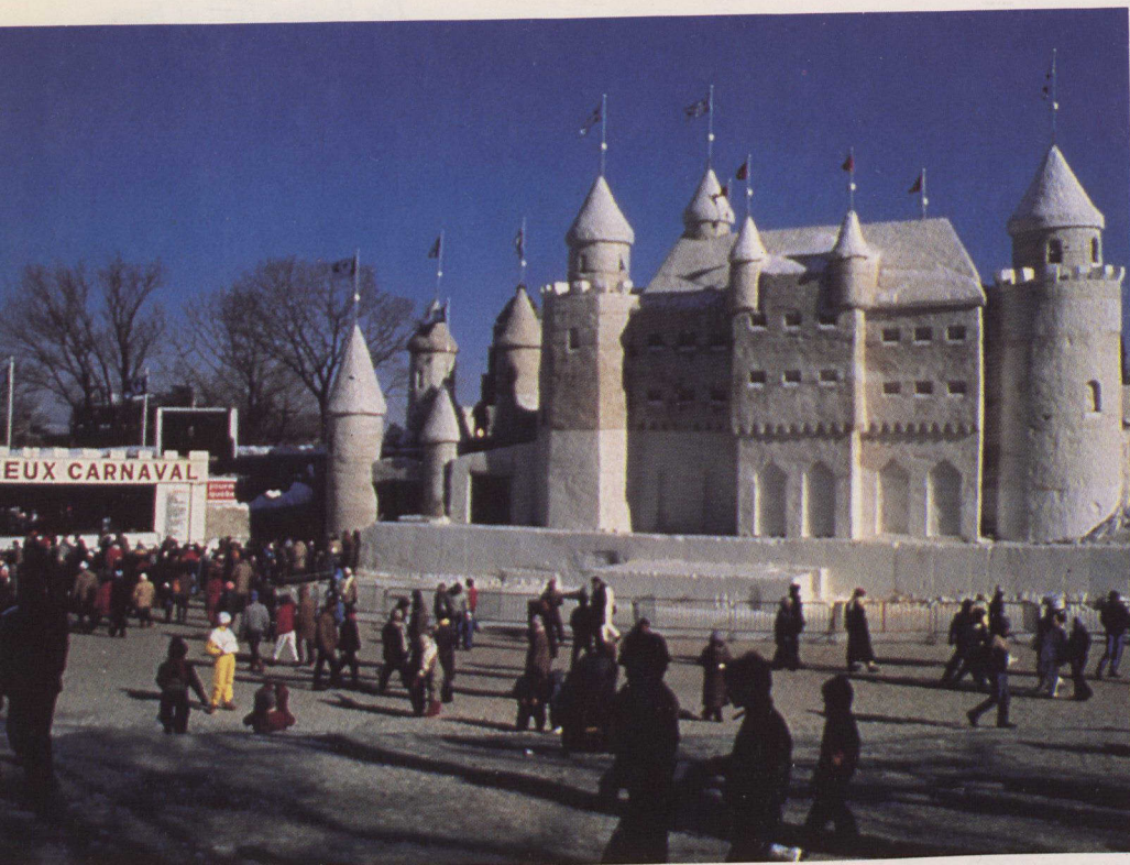
The Ice Palace, one of the main attractions of the Carnival of Quebec.

The hospitality of Quebec City is especially evident during its annual winter carnival when the city becomes a snow paradise. In proportion to its size, the Quebec Winter Carnival ranks as popular as the carnivals of Rio de Janeiro, Nice and New Orleans. Quebec City's population is more than tripled by tourists during this annual celebration. To many it is the most joyful winter event available anywhere.