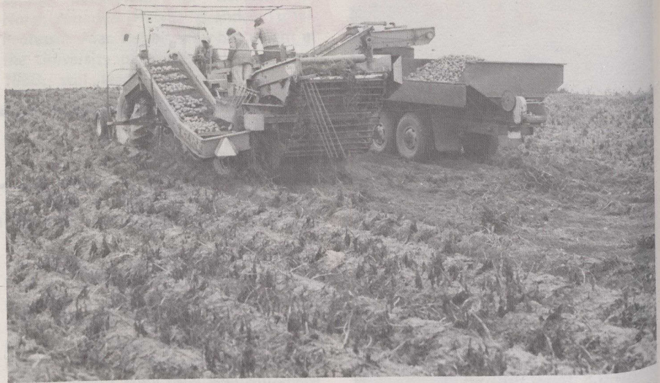
Potatoes, Ontario's major vegetable crop, have been sold out for some time.

In Nova Scotia, orchard acreage increased in the Annapolis Valley and the apple harvest is expected to reach record levels. Strawberry and blueberry production is also expected to rise dramatically.