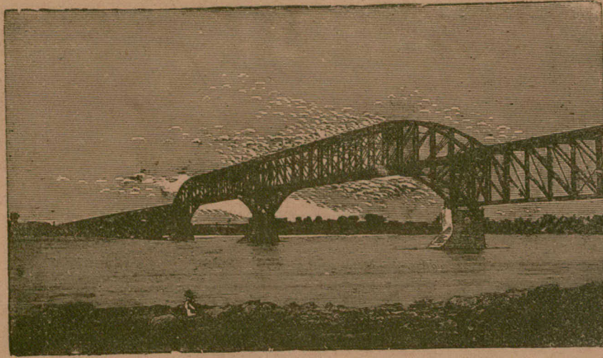
ST. LAWRENCE RIVER BRIDGE, CANADIAN PACIFIC RAILWAY, LACHINS, P. Q.

For Railways and Highways, Iron Bridges, Turntables Iron Piers and Trestles Bridge Rods Right and Left Hand Sleeve Nuts and all kinds of Structural Iron Work.