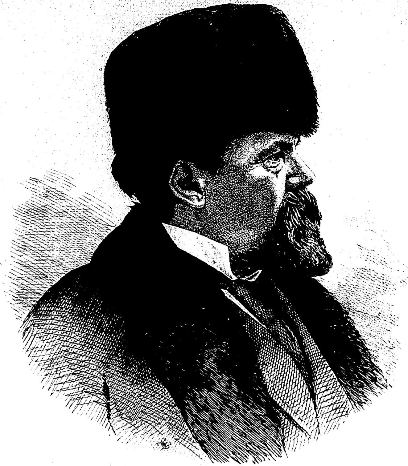
CHARLES JOSEPH COURSOL, Esq., JUDGE OF QUARTER SESSIONS.