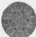
Locked Coil Aerial Cable or Colliery Guide.