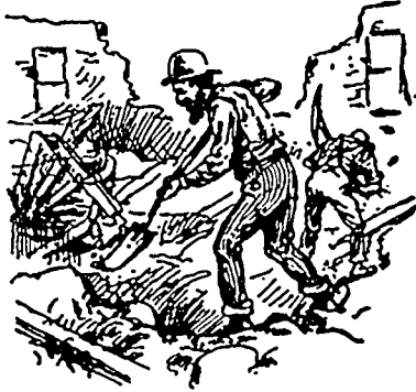
"I was helping dig out the cellar"

whom I knew had rheumatism very bad, running down the road. I called