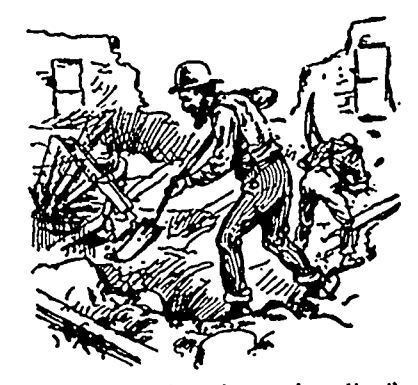
"I was helpin; dig out the cellar"

whom I knew had rheumatism very bad, running down the road. I called