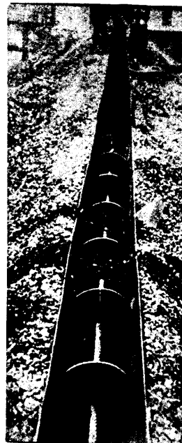
CABLE CONVEYORS FOR HANDLING COAL.

Electric Coal Cutters Compressed Air Coal Cutters Shearing Machines Long Wall Machines Dynamometers Electric Mine Locomotives Power Coal Drills Electric Mine Pumps Electric Mine Supplies