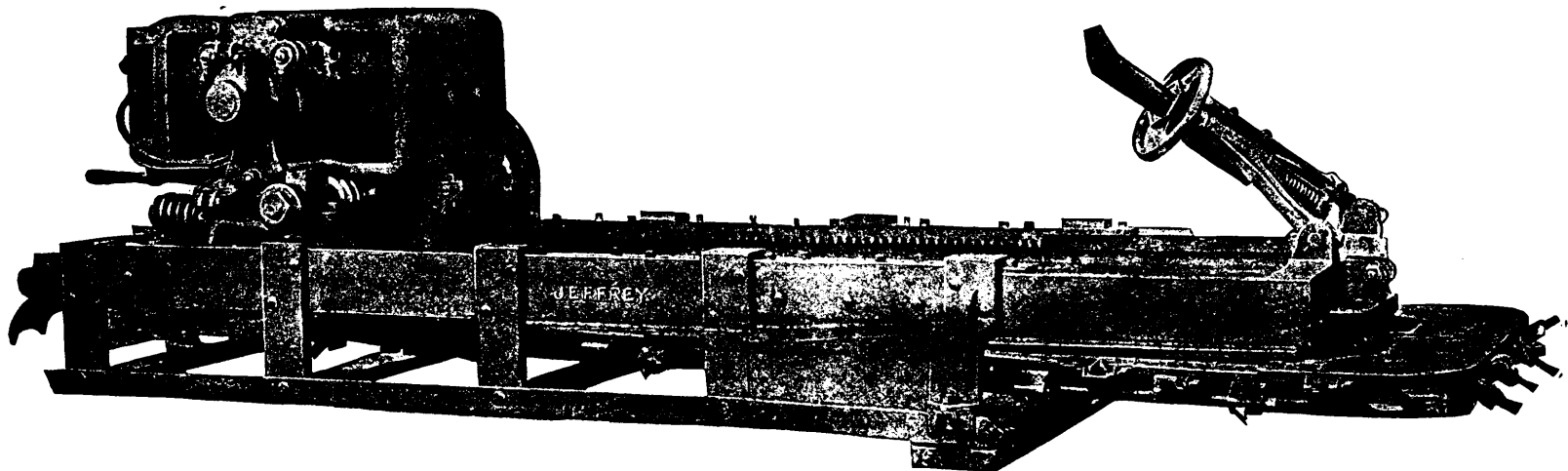
17A. Electric Chain Coal Mining Machine.

THE JEFFREY MANUFACTURING CO. COLUMBUS, OHIO, U. S. A.