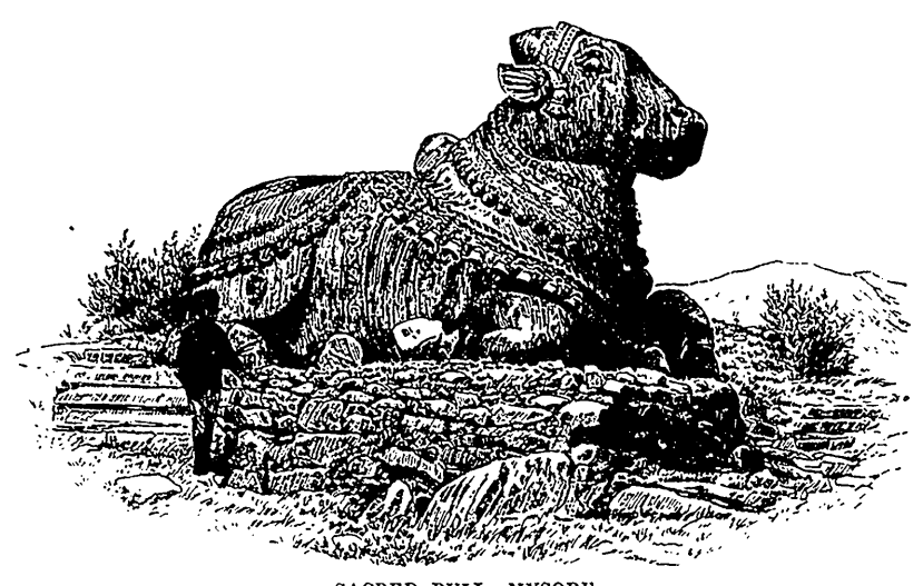
SACRED BULL, MYSORE.

pleasant climate. A peculiar feature in the scenery is the large number of isolated granite rocks called droogs , sometimes stupendous monoliths, sometimes huge boulders piled up, often rising 2,000 feet from the plain. Many of these are crowned with ruined fortresses, once the strongholds of robber chieftains, who