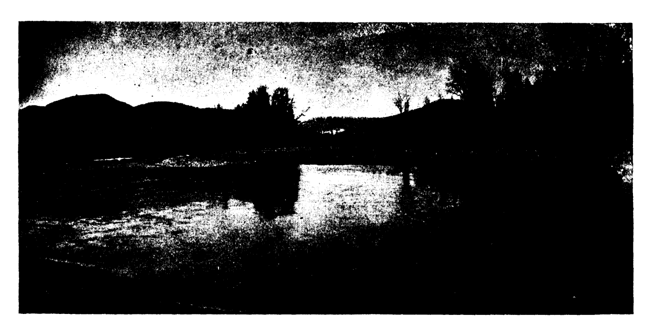
ABOVE LITTLE CANON, SKEENA.

the dark mouth of the canyon. Later in the day fourteen canoes passed by with 180 natives, bound for the Creck enters the left bank, where placer ground has